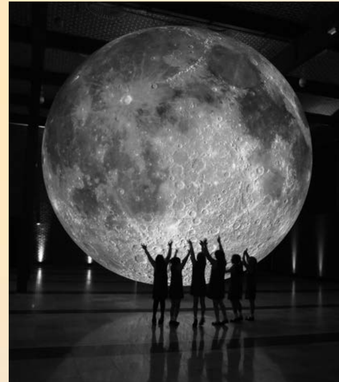
MUSEUM OF THE MOON by Luke Jerram

It is a tremendous sight that opens up as you enter the Graz parish church: the moon. Luke Jerram's light sculpture “Museum of the Moon” shows a replica of the moon with a diameter of six meters. Each centimeter replicates around five kilometers of the moon's surface, whose craters, mountains and valleys become visible to viewers. In this experience, NASA images of the moon merge with soft moonlight radiating from the interior, acoustically complemented by a surround sound composition by award-winning composer Dan Jones. The “Museum of the Moon” project has been shown in more than 300 exhibitions in around 30 countries and has already inspired millions of people. The viewer's interpretation changes from place to place - on the one hand a sign of our cultural differences, on the other hand proof of how much the moon touches people across all borders and thus connects them.