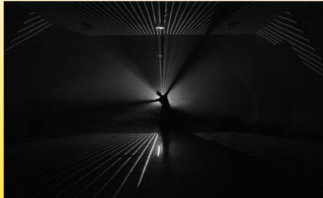
Lumière Sonore by studio A.I.L.O