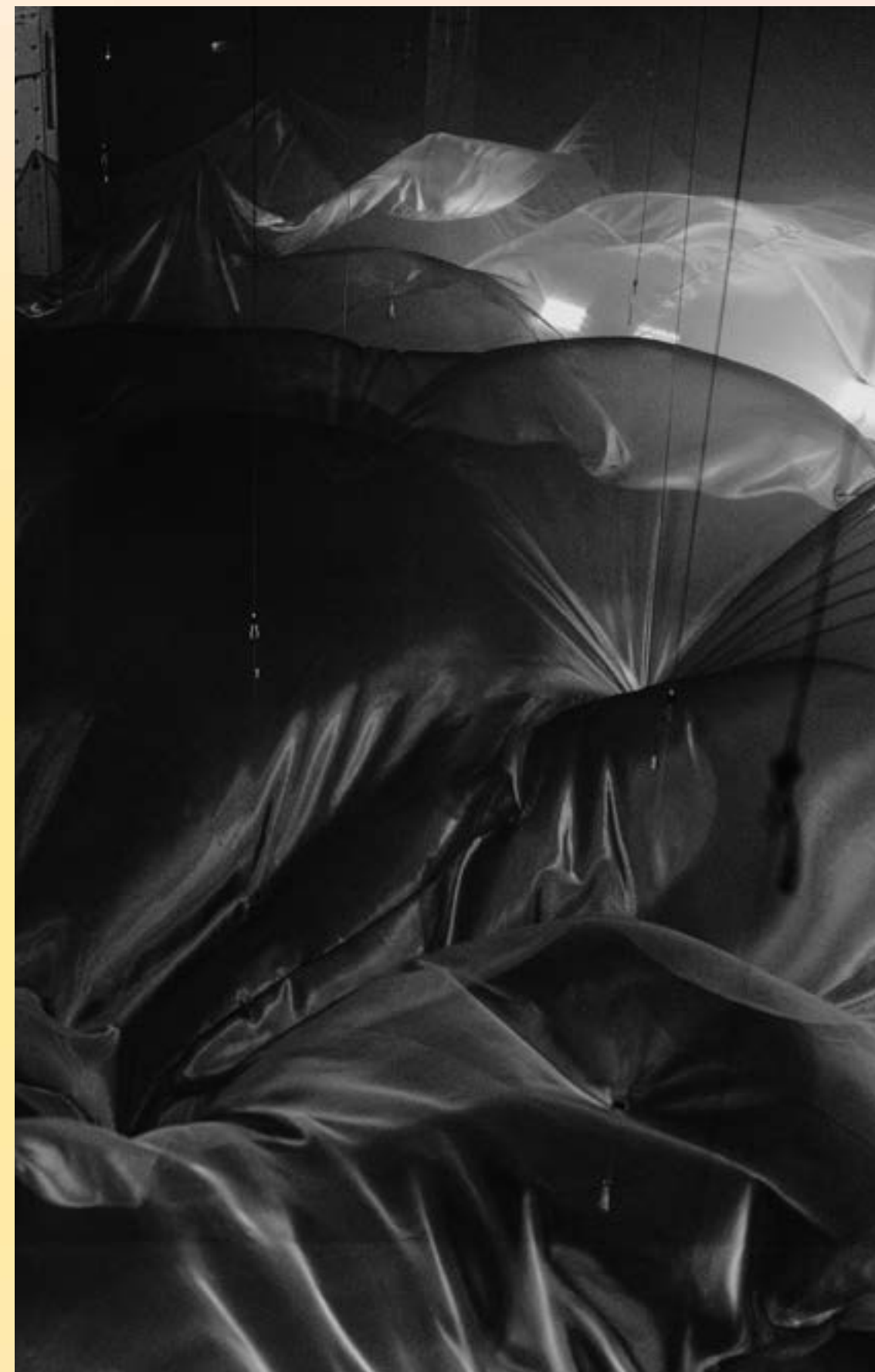
Einder / surface by Boris Acket